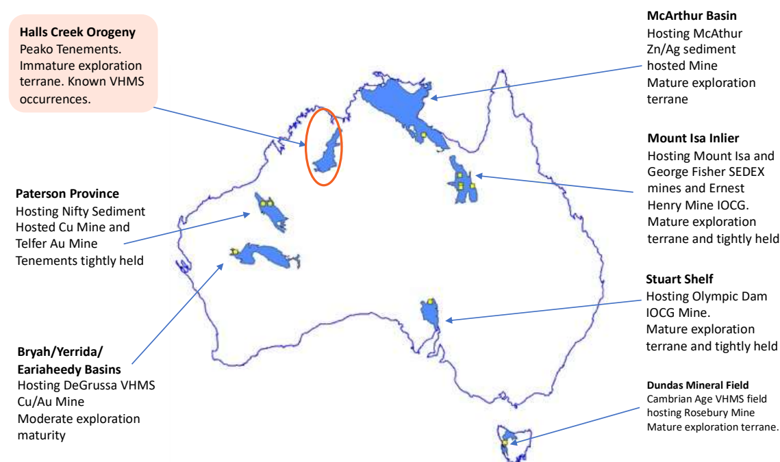
Figure 1 Australian Proterozoic Provinces

Sediment-hosted copper deposits are the focus of Peako's exploration of its tenement 3 in the Rudall River area of the Paterson Province.