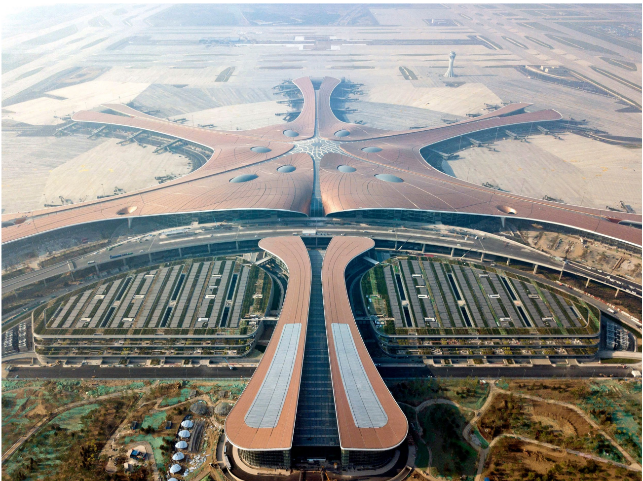
China's new AUD16bn mega-airport in Beijing