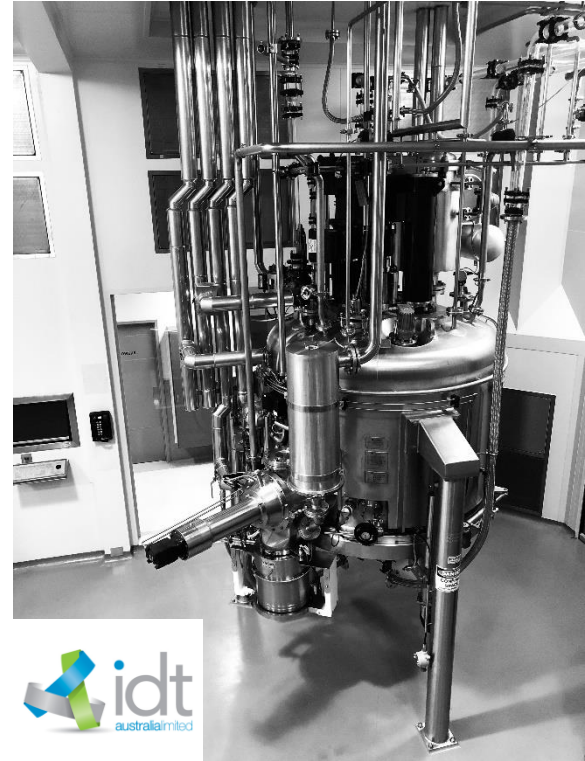
Existing pharmaceutical equipment at IDT Australia