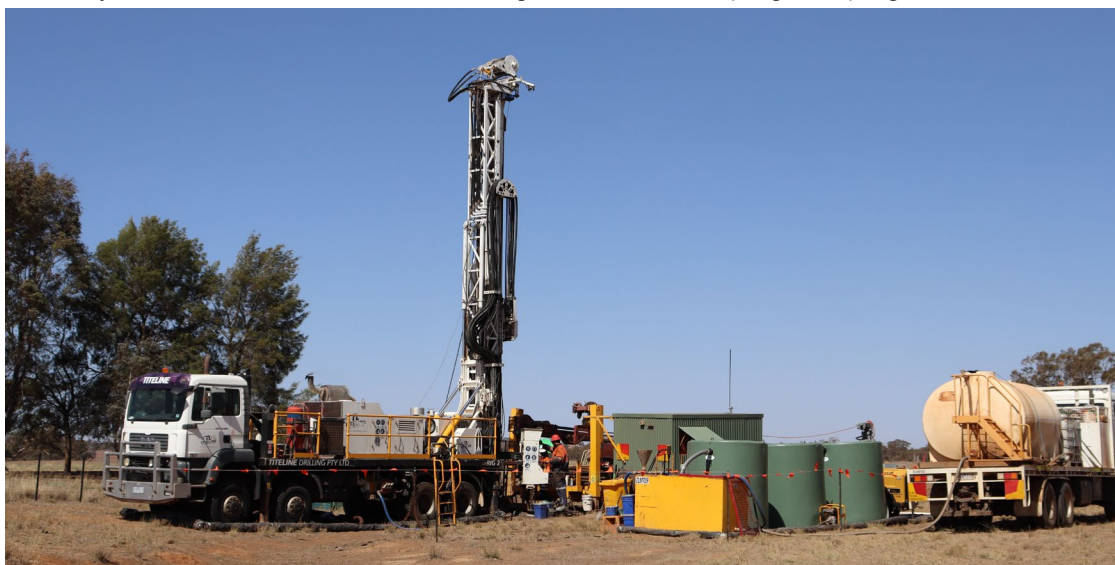
Drilling continues at Yarindury

"We expect a steady stream of newsflow over the coming months as these programs progress."