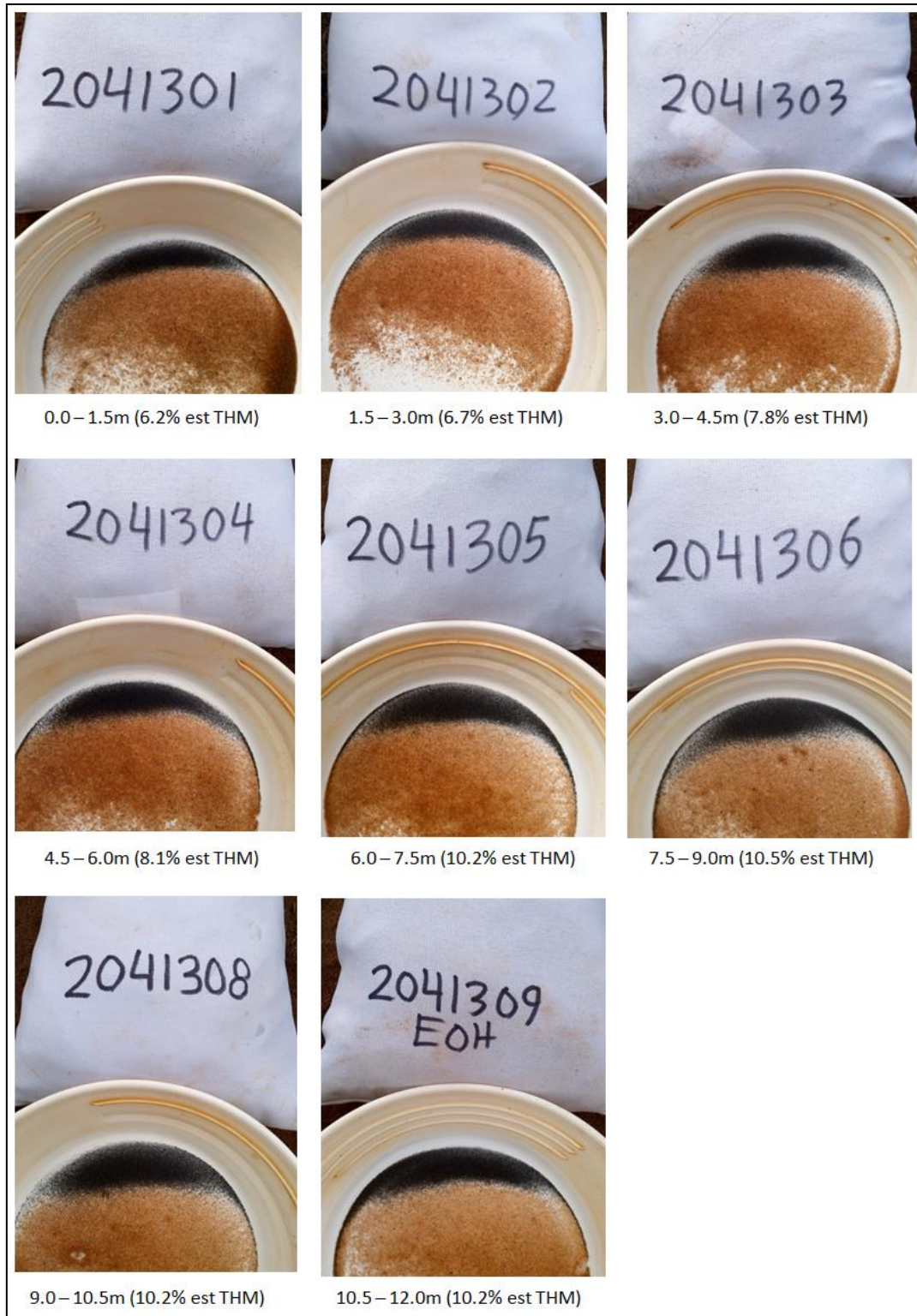
Figure 2: Field pan concentrate photos for auger hole 20CSHA413 showing the high grades intersected. Each sample shown is panned from the same volume of sand grab-sampled from the relevant 1.5m sample interval.