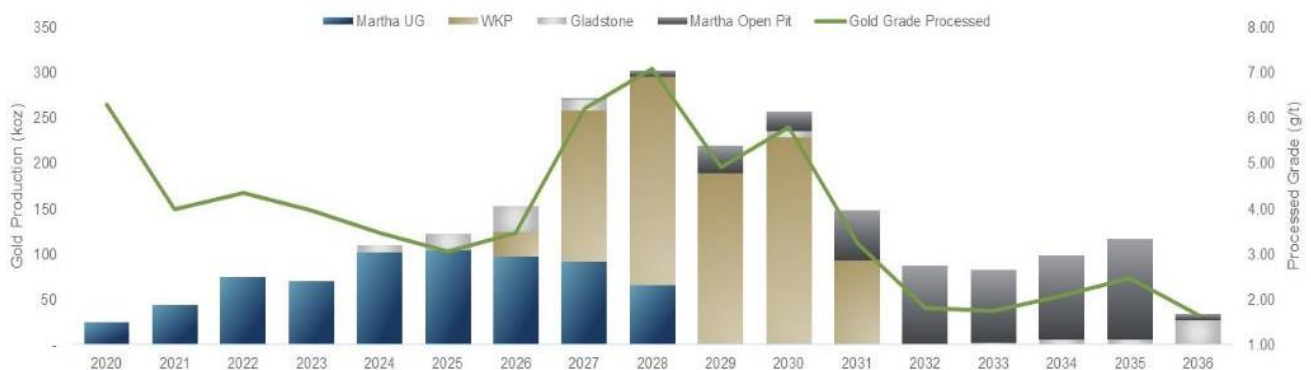
Figure 2 – Forecast Production Summary by Deposit

Average annual gold production is based on the total production expected over the initial mine life and includes the ramp-up period; thus, total gold production from the start of production until depletion of the mineral resources is assumed. Steady-state production assumes average production rates following ramp-up of mining operations. The Company will continue to drill both the Martha and WKP underground deposits with the aim of increasing the size of both resources.