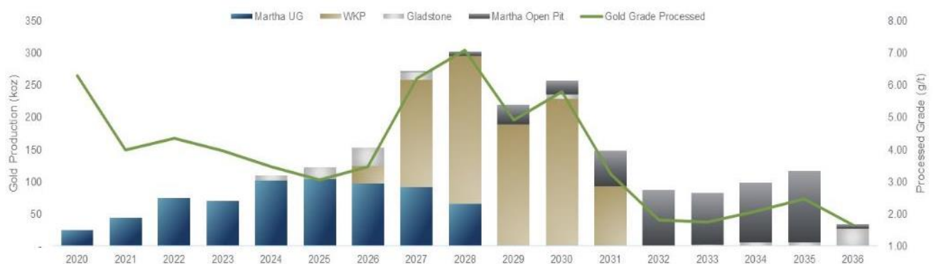
Figure 2 – Forecast Production Summary by Deposit

Average annual gold production is based on the total production expected over the initial mine life and includes the ramp-up period; thus, total gold production from the start of production until depletion of the mineral resources is assumed. Steady-state production assumes average production rates following ramp-up of mining operations. The Company will continue to drill both the Martha and WKP underground deposits with the aim of increasing the size of both resources.