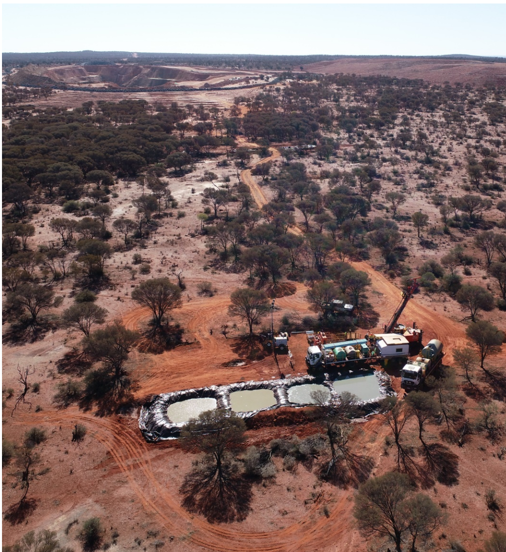
Figure 2: TLMJV – Underground Stage 3 and 4 drill positions looking north towards the TLMJV open-pit mine.

In the June 2020 Quarterly Activities Report 1 it was reported that a two-hole Stage 4 diamond drill programme had been undertaken, a further 200m south of the Stage 3 programme, and that '...assays are due in August...'. As at the date of this report such assays results are yet to be received.