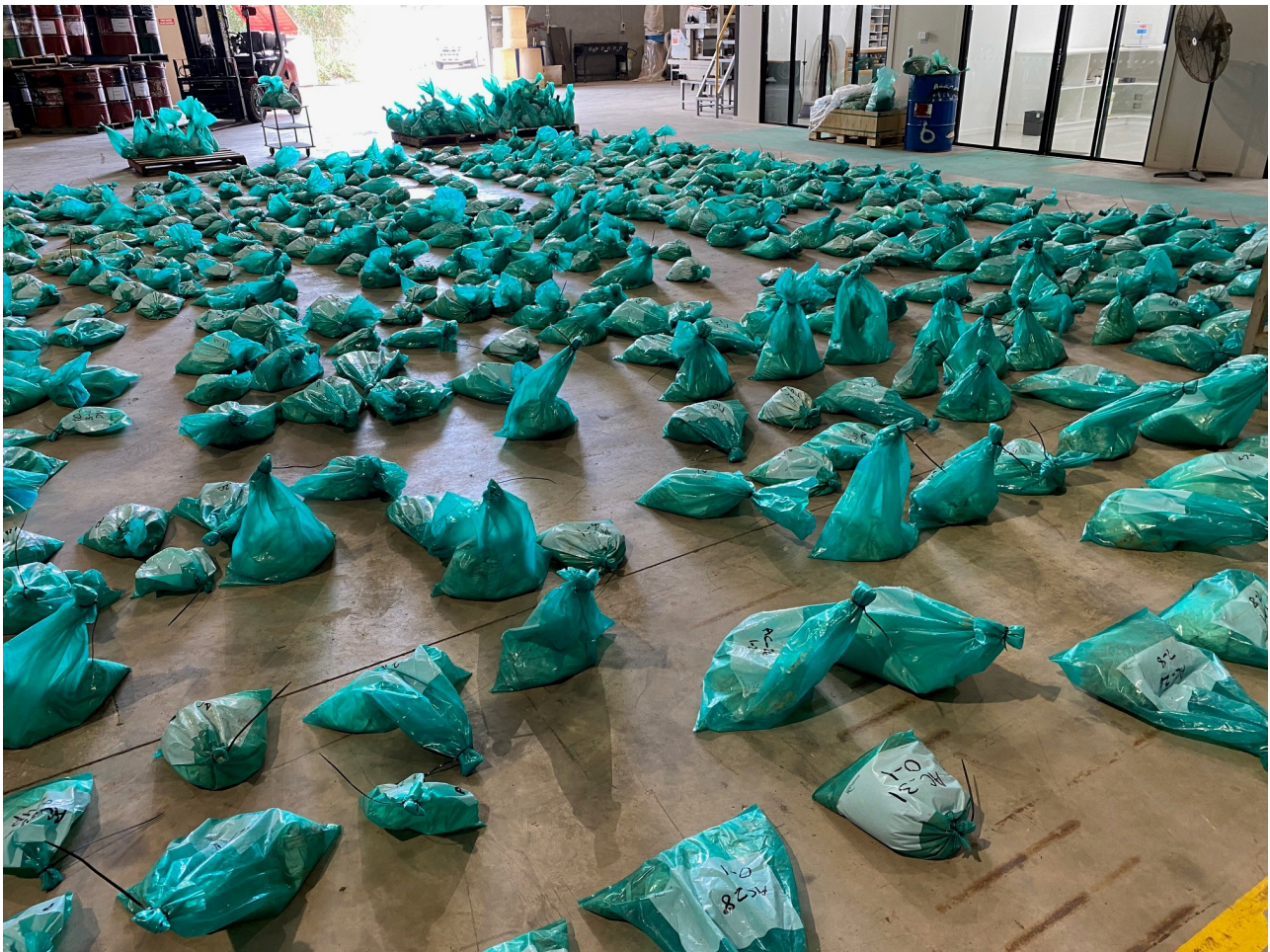
Image showing Beharra air core drilling samples being received and catalogued at IHCR’s Yatala, Queensland laboratory facility

As announced to the market on 17 th August 2020, Perpetual had selected mineral sand specialist consultancy and laboratory operator IHC Robbins to undertake a detailed metallurgical testing program at Beharra. IHCR’s activities are aimed at assisting in the optimisation of the beneficiation process which will aid in the provision of detailed silica sand product quality specifications. To commence the detailed test work, Perpetual was required to road freight over 2,000kg of samples from Perth, Western Australia, to IHCR’s Yatala, Queensland, state of the art laboratory. This transportation process was undertaken extremely smoothly, with all samples received by IHCR expeditiously.