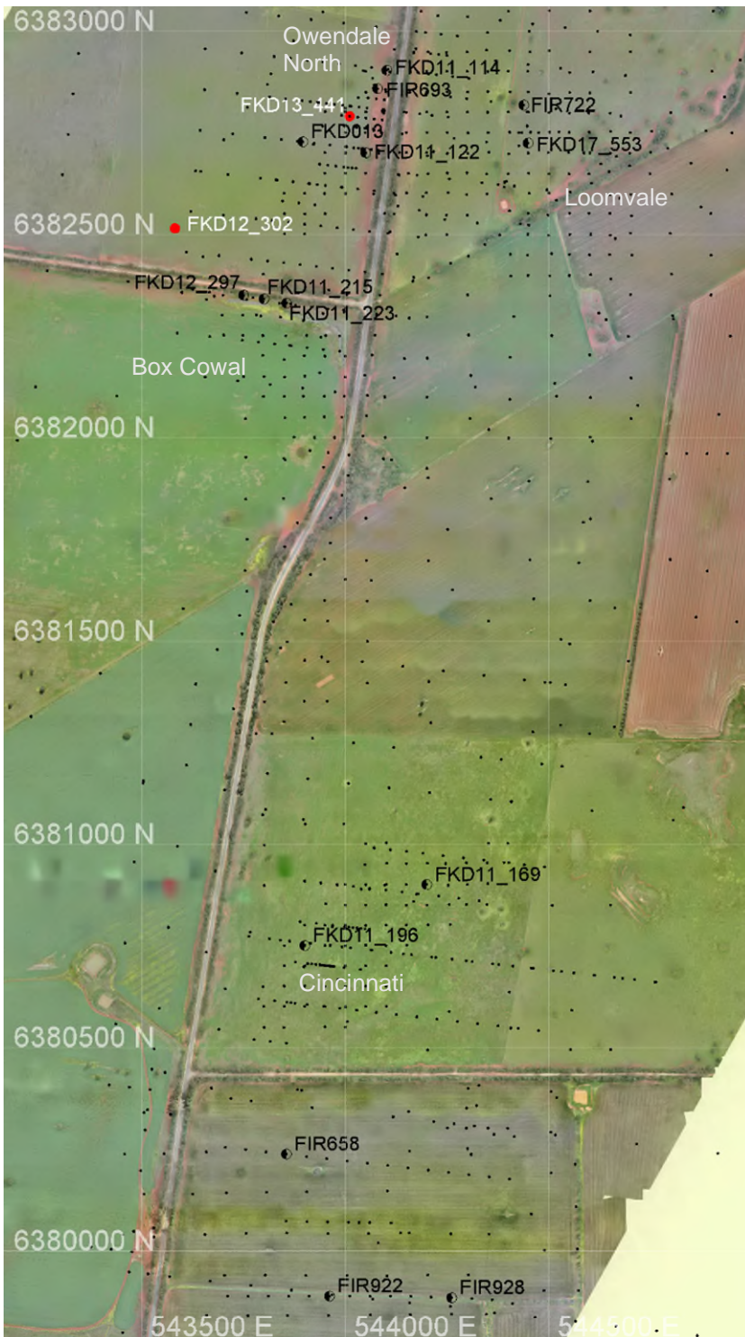
Figure 2 – Location of selected drill holes

The district also has interesting copper potential with a number of small deposits in the area. Historical PSP drilling has also highlighted a zone of supergene copper enrichment. There are several isolated high copper occurrences in bedrock, including: