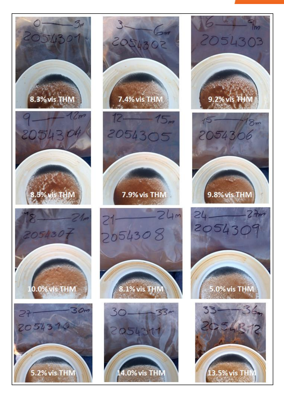
Figure 3: Field pan concentrate photos of samples from aircore drillhole 20CSAC543 showing the mineralised profile (beginning top left) and the high grade mineralisation discovered in the main Nhacutse zone.

MRG Metals Limited ABN: 83 148 938 532 / ASX Code: MRQ