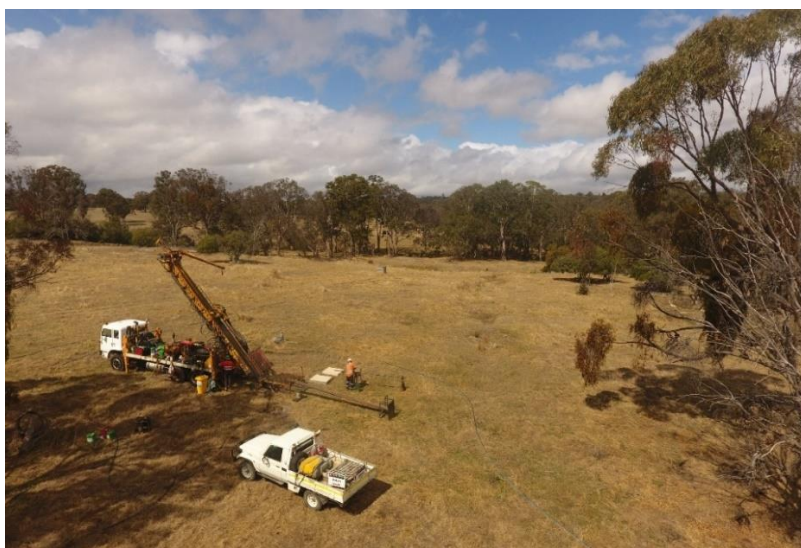
Figure 1 Drilling commenced at Curry's Lode target

Address: Level 6, 350 Collins Street, Melbourne, VIC, 3000, Australia