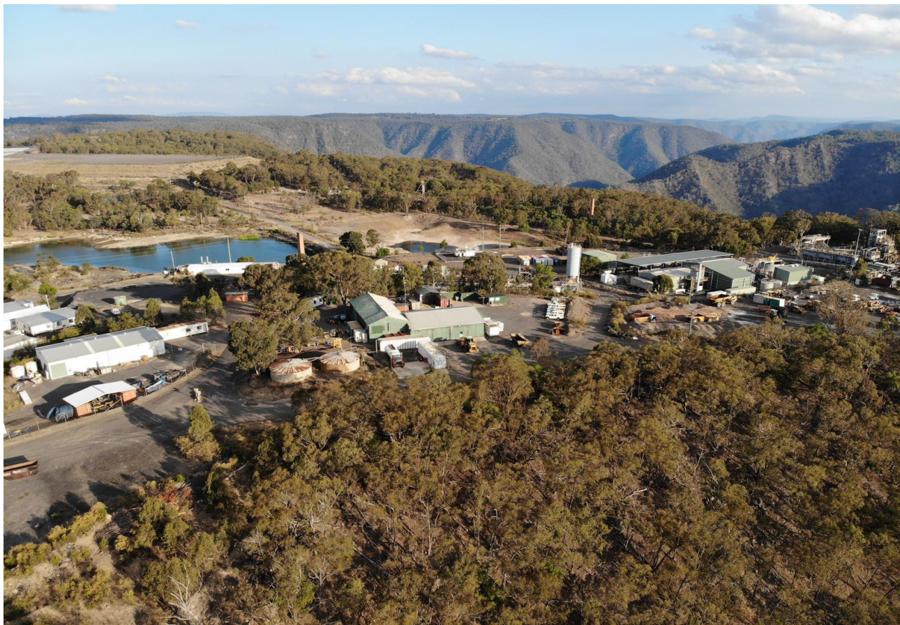
Figure 4 Hillgrove Gold Project

The Hillgrove Gold Project has a material high-grade JORC 2012 Compliant Mineral Resource of 5.0Mt @ 4.3 g/t Au & 1.5% Sb (6.4 g/t Au Eq.) (686koz gold & 74kt antimony).