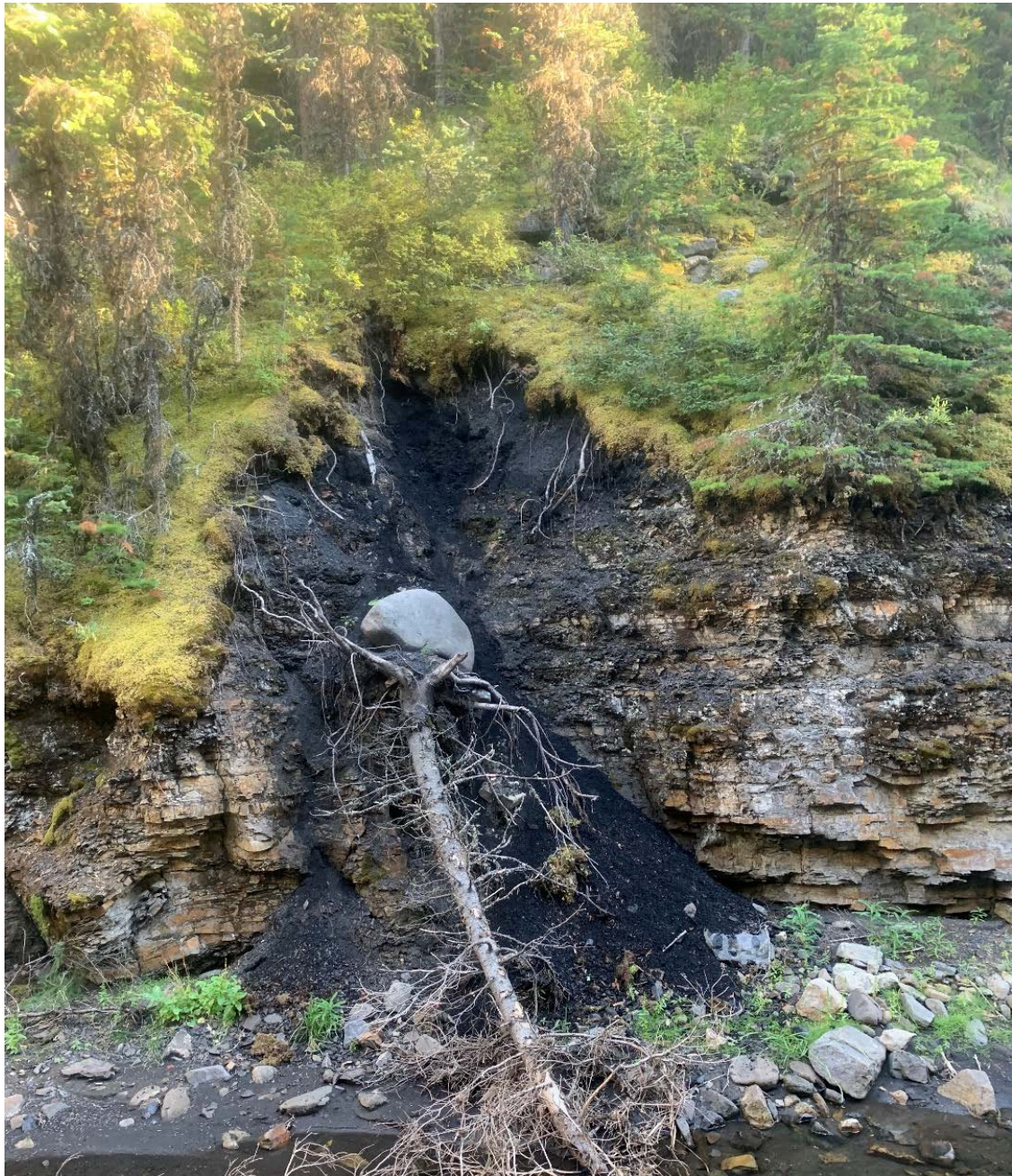
Figure 2: Coal outcrop along Isolation Creek, Isola Project