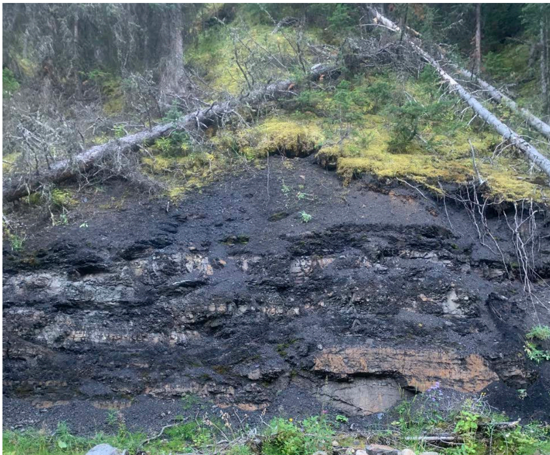
Figure 1: Coal outcrop, Isola Project

The Company also continues to progress the permitting process to restart our Tent Mountain Mine. Using funds from the recently completed $8 million Initial Public Offer, our regulatory team are finalising the mining licence application and associated permit amendments which are the final approvals required to recommence mining at Tent Mountain. We expect to lodge applications to restart the mine with the Alberta regulators this quarter. Montem has completed a Definitive Feasibility Study for the Tent Mountain Mine and aims to restart hard coking coal sales of ~1.1Mtpa from the mine in H1 2022.