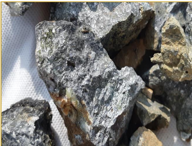
Massive arsenopyrite hosted in stockwork quartz veins