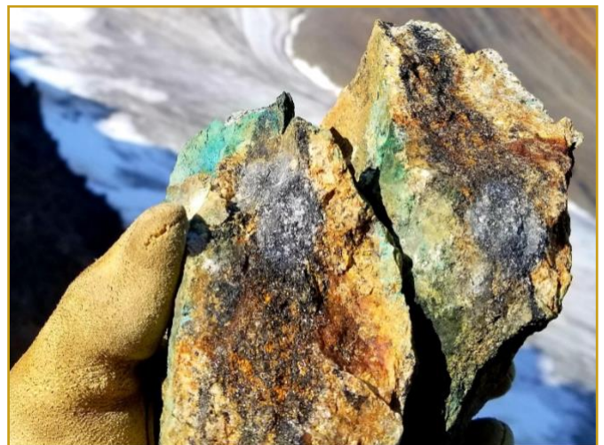
Arsenopyrite hosted in quartz-tourmaline vein