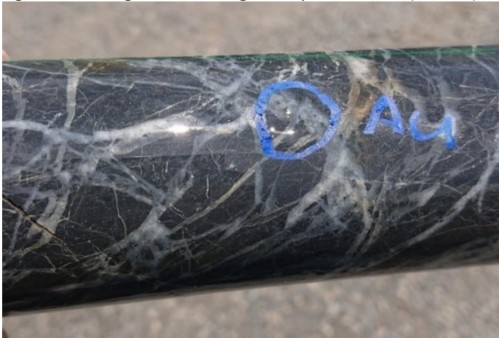
Figure 1 Coarse grained visible gold in quartz breccia (ELG147) in RVR's drilling at Eleanora

Red River Resources Limited (ASX: RVR) is pleased to announce further results from its drilling program targeting the Eleanora Lode at its Hillgrove Gold Mine in NSW, Australia.