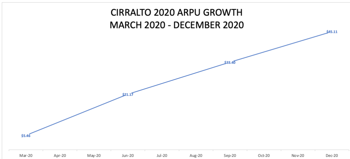
Cirralto Average Revenue Per User Growth March 2020 to December 2020

Average Revenue Per User (“ARPU”) grew from 50% through the quarter to close at $45/customer at the end of the quarter.