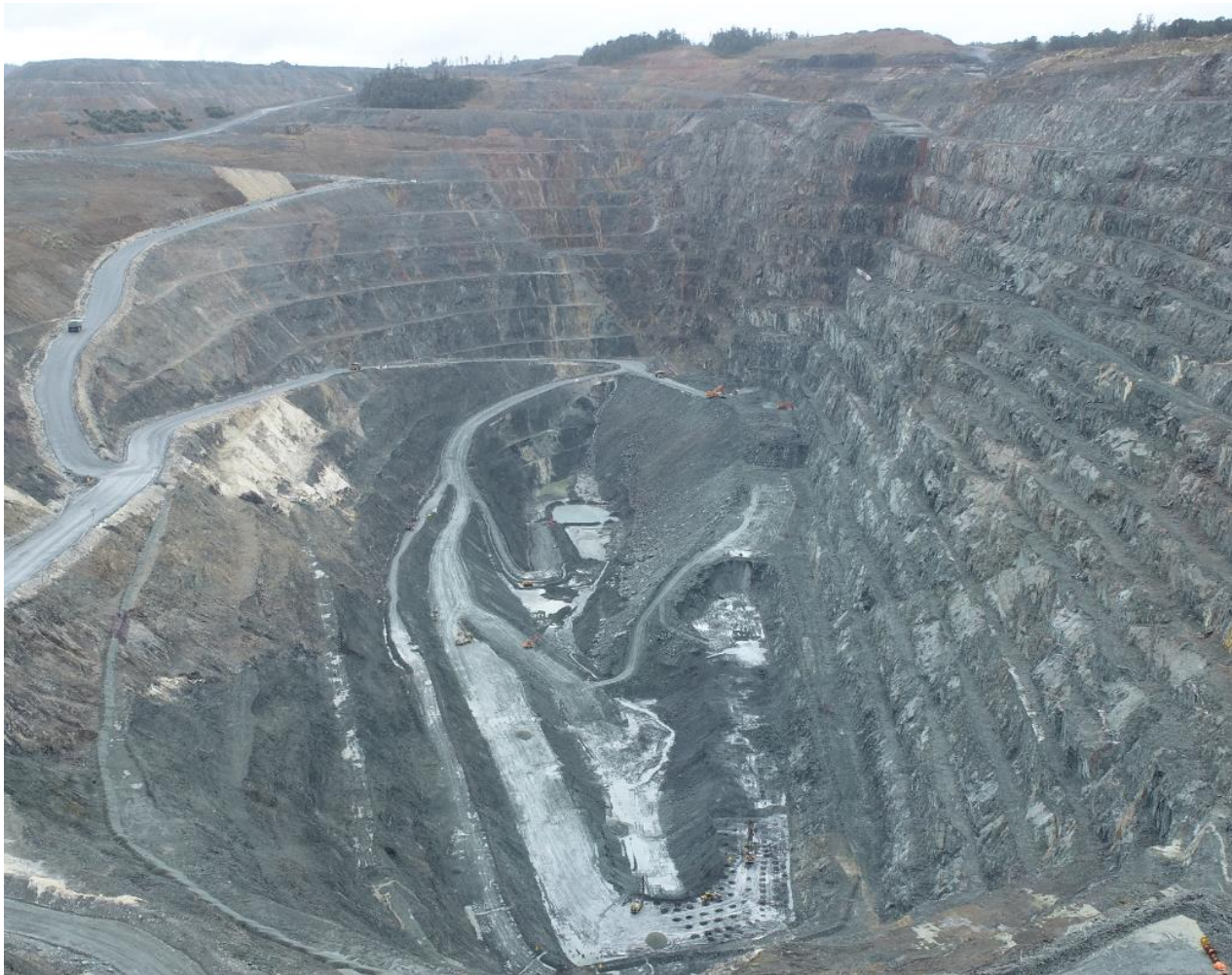
Mining in North Pit, Savage River