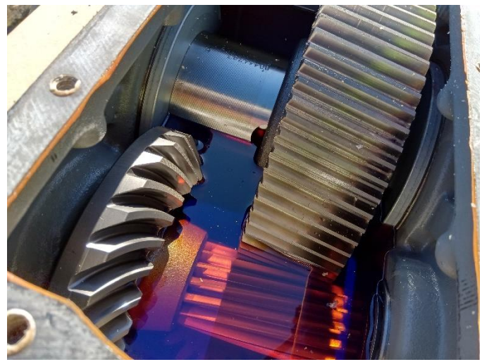
Figure 1: Killanoola 1 surface pump