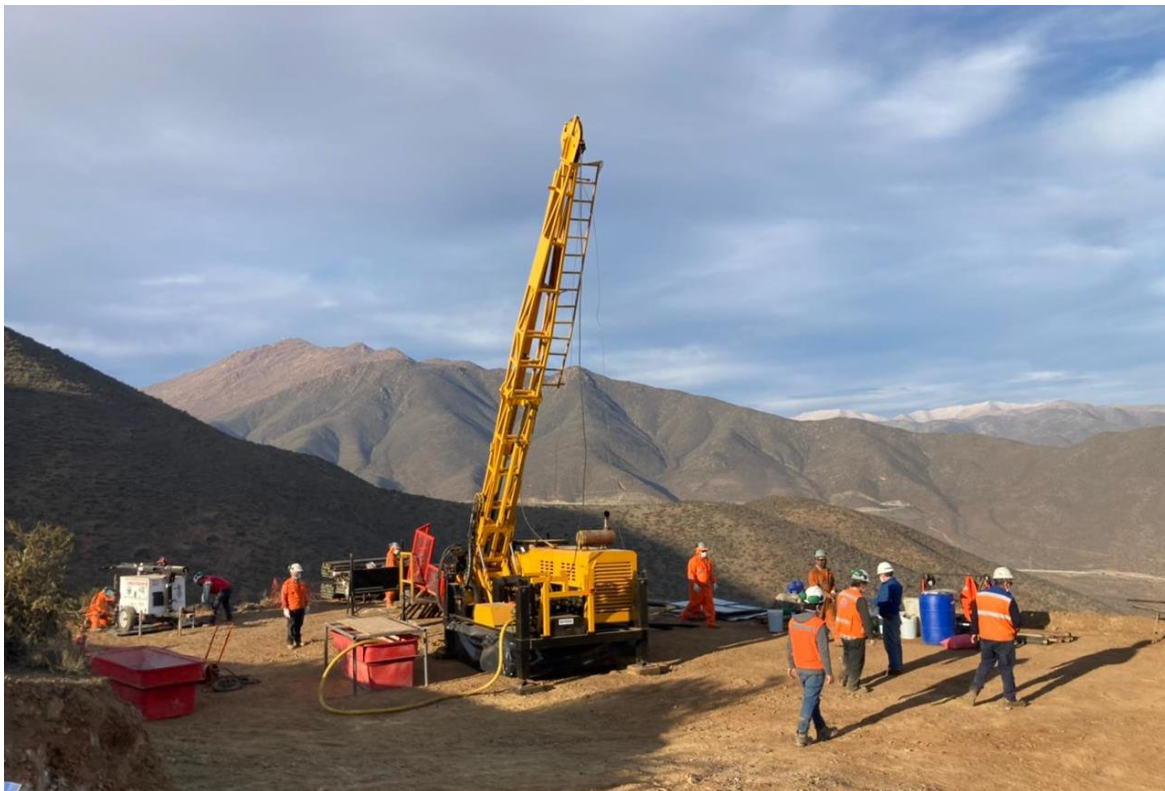
Image 1: diamond drill rig on site at first of three planned drill holes

The first drill hole has been designed to test the high intensity Induced Polarisation ("IP") chargeability anomaly identified during exploration activities in late 2020 (see Freehill's ASX announcement dated 26 November 2020 titled 'Induced Polarisation Identifies Very Large Potential Copper Structure at El Dorado'). The remaining two drill holes are proposed to test a number of targets outlined during the recent mapping and geophysical survey undertaken in December 2019 (see the Company's ASX announcement dated 9 December 2019 titled 'Significant Indication of Copper Mineralisation Identified in the Northern Area of Yervas Buenas'). Drill locations are shown on image 2 below.