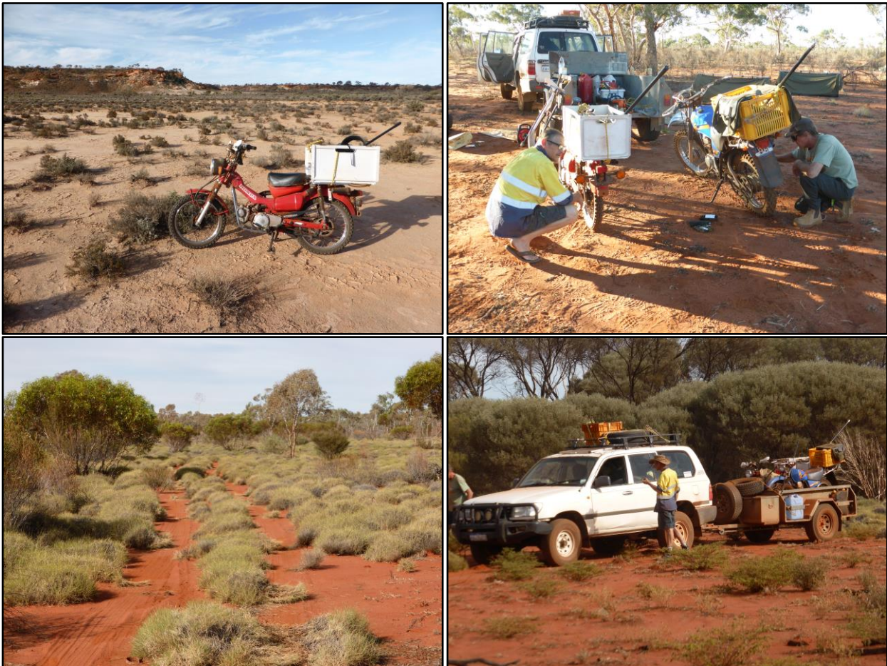
Photo 1. Sefton Project lag sampling.

The field crew have reported that the Lag sampling is progressing well. The modified “postie-bikes” allow the samplers to access remote sample sites through difficult terrain. Octanex’s near-term objective is to identify areas of anomalous geochemistry along structural trends, that will be targets for follow up geochemical evaluation, and potential drill testing in the longer-term.