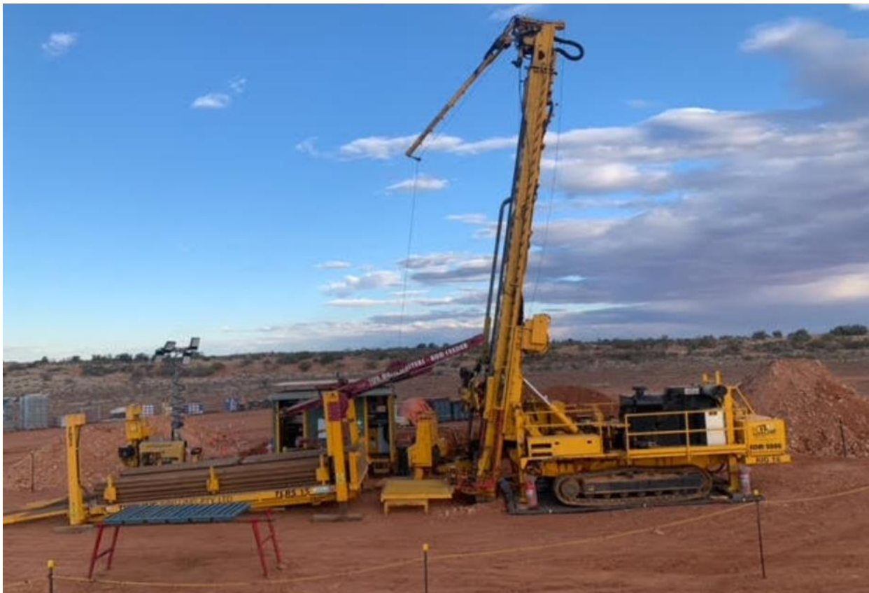
Figure 1: Photograph of Titeline drill rig set up at Horse Well (HWDD_04 collar location).

Cohiba Minerals Limited (ASX: CHK, 'Cohiba' or 'the Company') is pleased to announce that Titeline Drilling's rig has arrived at the Horse Well Project and is about to commence drilling (Figure 1).