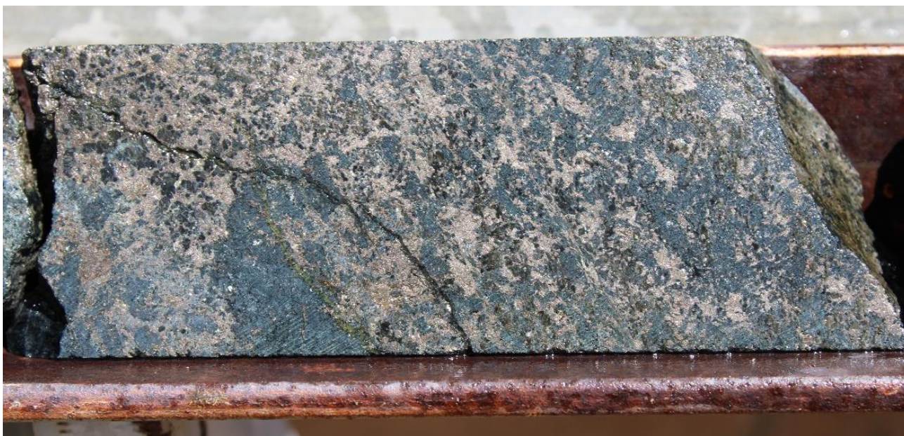
Figure 1: CNDD001A at 635.9m down-hole showing matrix-textured sulphide zone (NQ core ~48mm diameter)

Drill holes CNDD001A and CNDD002 both intersected mafic / ultramafic intrusive units with evidence of disseminated and semi-massive magmatic sulphides as shown below (Fig 1,2). Simplified lithological logs are detailed in Appendix 1 & 2. The drill holes contain inherent similarities in host rocks and sulphide mineralisation style to the nearby Tea Tree Nickel-Copper Sulphide Prospect (Fig 3, Table 1) which recorded a 10.4m intersection at 0.25% Nickel and 0.28% Copper in drill hole TT00D1 1 , located approximately 2.75km southeast of Kalarka.