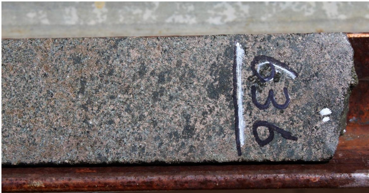
Figure 2: CNDD001A at 636.5m down-hole showing semi-massive sulphide zone

The presence of a Tea Tree equivalent mafic system at Kalarka greatly increases the size of the known prospective mafic system. This expands the prospective search area worthy of further exploration for repeats or thicker/higher grade intersections of the mineralisation at Tea Tree and Kalarka.