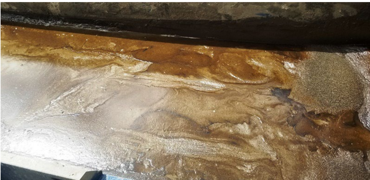
Figure 1 - Significant volumes of oil on the shakers at intercept of “N” structure

The Alameda-1 8-1/2” hole section has now been drilled through the Vega Alta seal and is currently at a depth of 3,200m within the first of the Primary Targets referred to as the N Sheet. Strong oil shows have been recorded from limestones within the unit. Free oil has been observed within the mud system at surface along with elevated mud gas readings and associated hydrocarbon fluorescence of up to 95%. The high quality shows have been recorded from 3,055 to 3,200mMD to date (over a gross interval of 145m) to date which also contains zones with good indications of fracturing (that is likely to provide enhanced deliverability from the reservoir). There was also fluorescence (but not as high gas) starting at 2,900m with some oil in samples and on shakers from 2,950mMD. After completing a wiper trip, drilling is now continuing through the N Sheet toward the prognosed base of the interval expected at ~3,400m. Further information will become available once wireline logs have been acquired over the interval and interpreted.