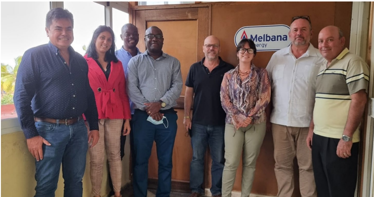
Figure 3 - Melbana Energy's Executive Chairman (2nd from right) with members of the company's operations office in Varadero, Cuba

We are very encouraged by what this well has told us to date, particularly given we have encountered oil shows now over two significant intervals with this latest area also having significant gas influx, which is a good sign that any reservoir may be well charged. Subsequent logs and studies will tell us the significance of what we’re encountered but given the size of these structures it allows for the possibility of a material accumulation of oil”.