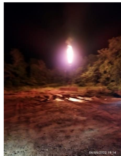
Figure 1: Tangai-5 gas flare www.bassoil.com.au

“Achieving an initial flow rate of 1,120 bopd is a very exciting result. We look forward to achieving a strong steady production rate which will most likely triple our current oil production in the KSO. This uplift, combined with the higher oil price in the current market, will see our initial investment repaid in less than three months.”