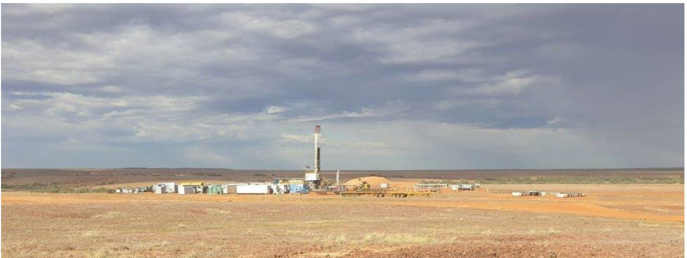
Figure 2: Yarrow Well activity at Innamincka Project - 15 September 2022