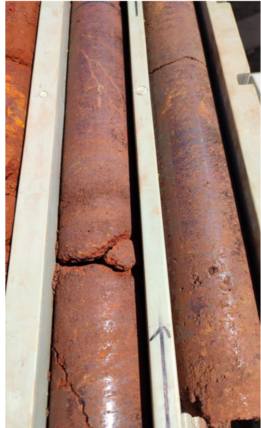
Bekisopa drill core for hole BEKD72 showing weathered zone iron mineralisation at surface.