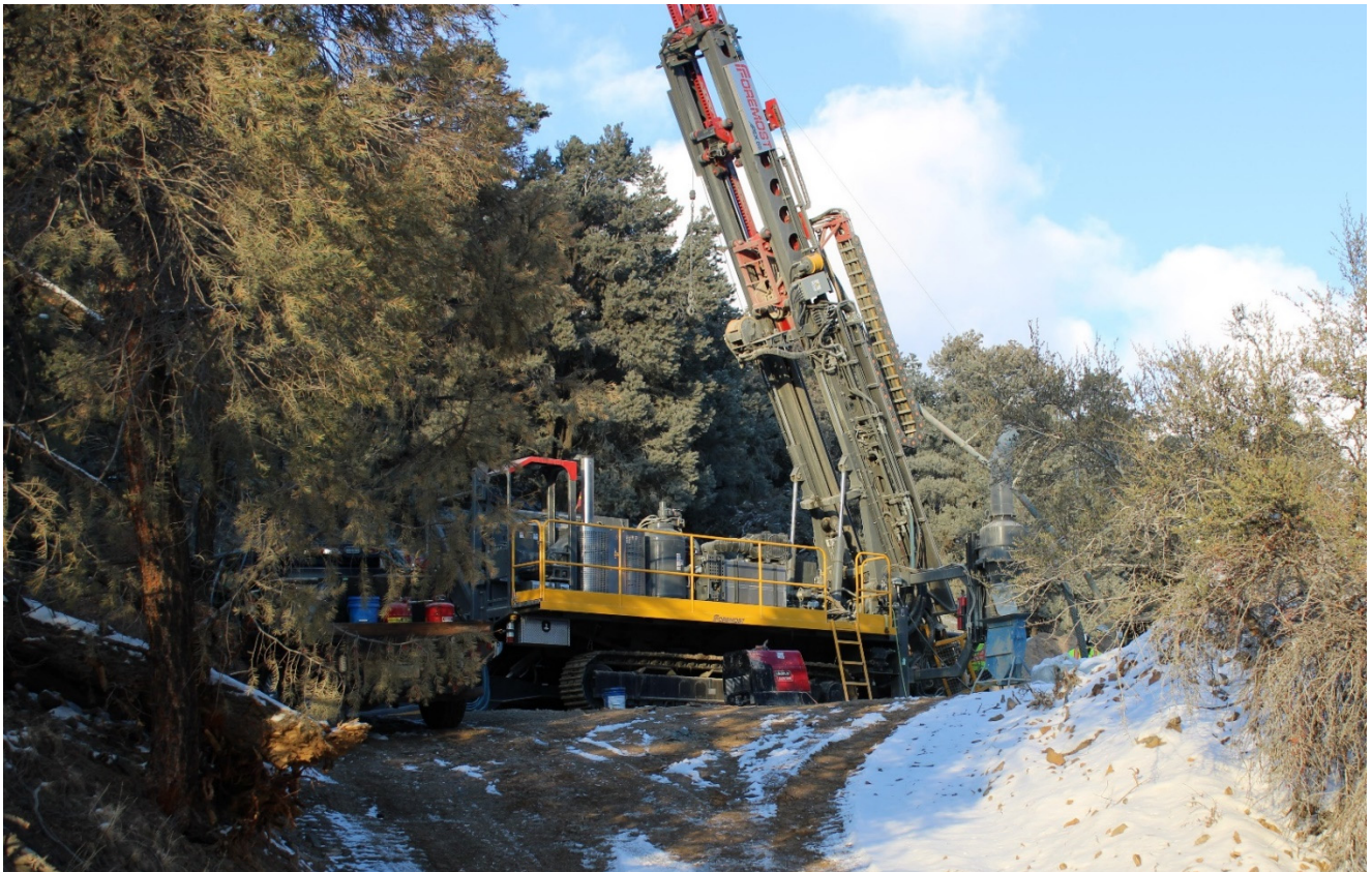
RC Drilling, New Pass Project, Nevada, USA