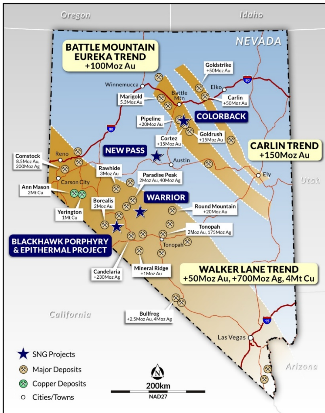
Figure 3. Location of SNX projects in Nevada, USA showing the location of the major gold and copper deposits.

Sierra Nevada Gold (SNX) is a recently listed ASX company actively engaged in the exploration and acquisition of precious and base metal projects in the highly prospective mineral trends in Nevada, USA since 2011. The Company is exploring five 100%-controlled projects in Nevada, comprising four gold and silver projects and a large copper/gold porphyry project, all representing significant discovery opportunities for the company.