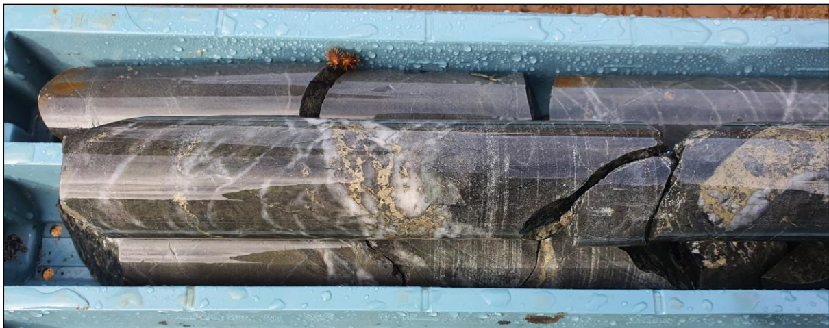
Figure 4: A chlorite-epidote altered chalcopyrite sulphide quartz vein overprinting potassic biotite-magnetite veins from 322m in Hole 4

Although the results received to date from the drill program provide encouragement that there is potential and the project warrants further work, FAU has determined that the scope of the required work is beyond its current resources and that it will for the time being preference pursuing other more prospective targets where exploration can also be conducted at a lower cost. Further exploration of Dogwood will likely require a number of holes drilled at greater depth than the work FAU has conducted. As such, FAU will also not be assaying the remaining 8 holes as it does not expect the results to be significantly different from those received to date.