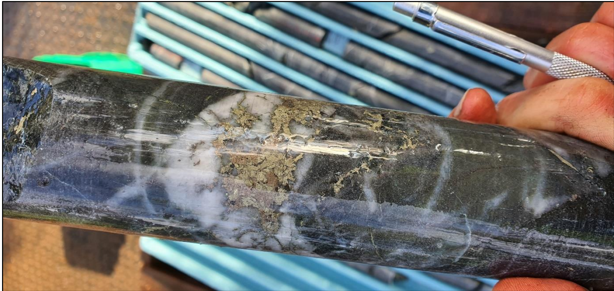
Figure 3: Chalcopyrite + Pyrite + Quartz veins from Hole 4 @ 322.5m.