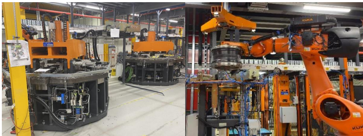
Image: New mould stations located in the Mega-line configuration