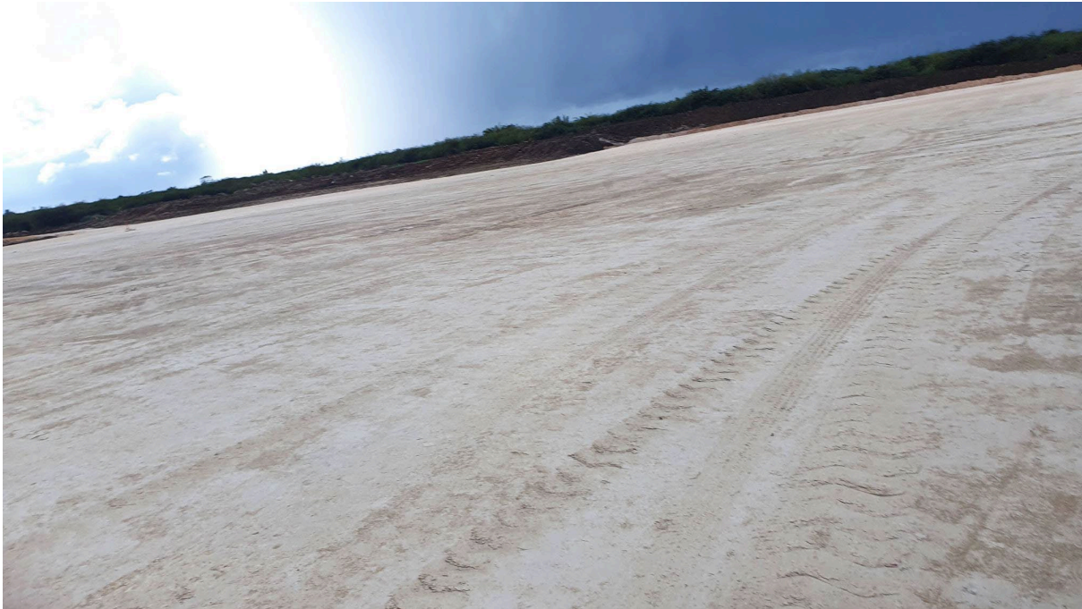
Figure 2 - Alameda pad in good condition and ready for installation

The Alameda-2 well, the first of two appraisal wells planned for 2023, will test the Amistad reservoir (which has been subdivided into three units) – identified by the Alameda-1 well that was completed in 2022 (Figure 3).