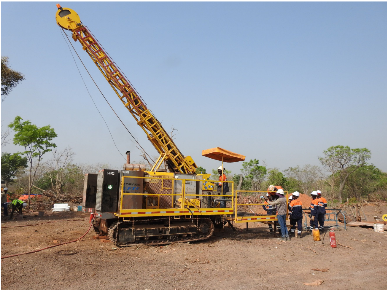
Figure 1: First hole of the 10,000m Kada diamond drilling program.