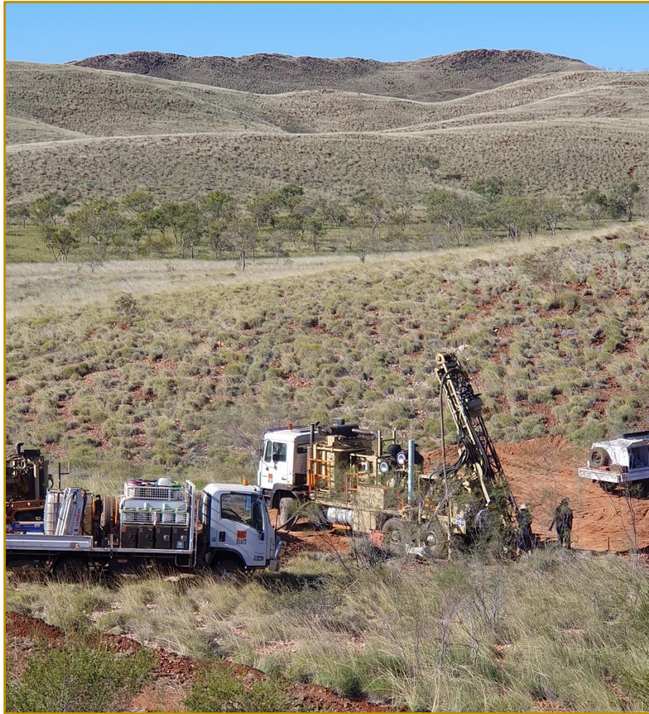
Figure 1: Drilling underway at Pinnacle Well Lithium Prospect at Talga.