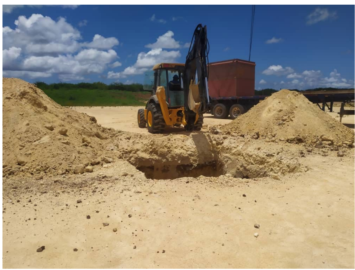
Figure 2 - Construction of the cellar prior to the installation of the conductor