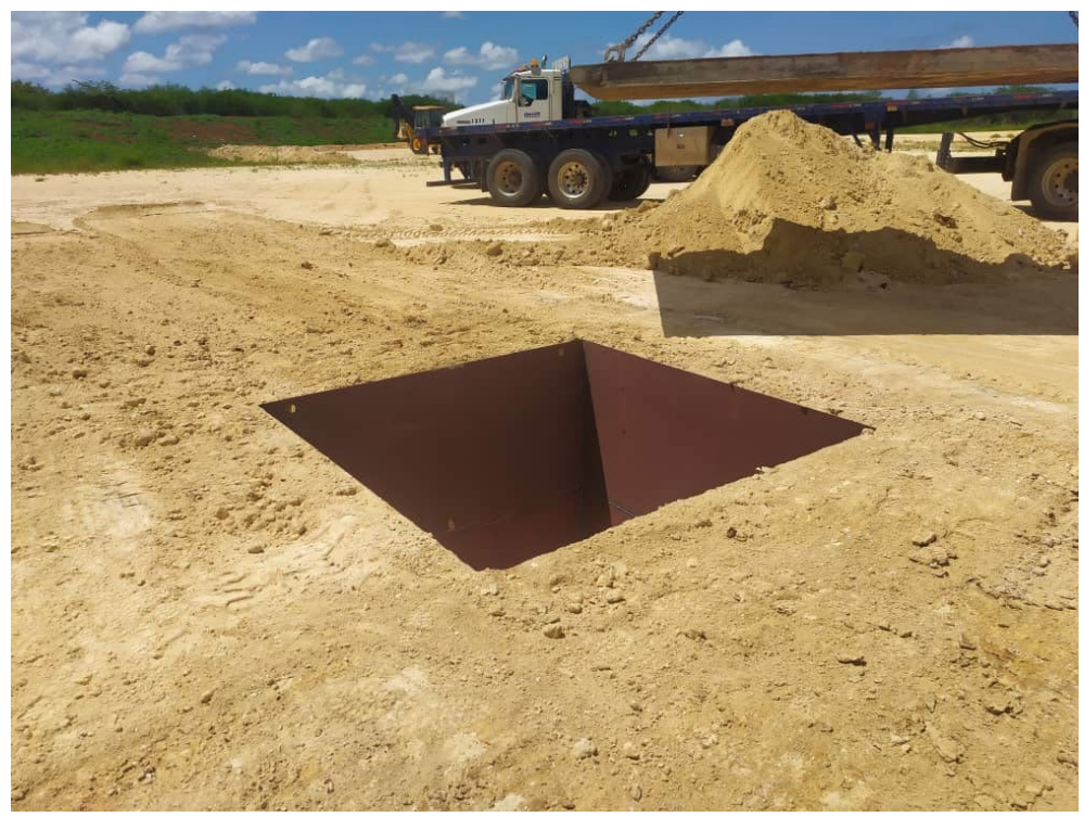
Figure 3 – Completed cellar to provide structural foundation for the drill program