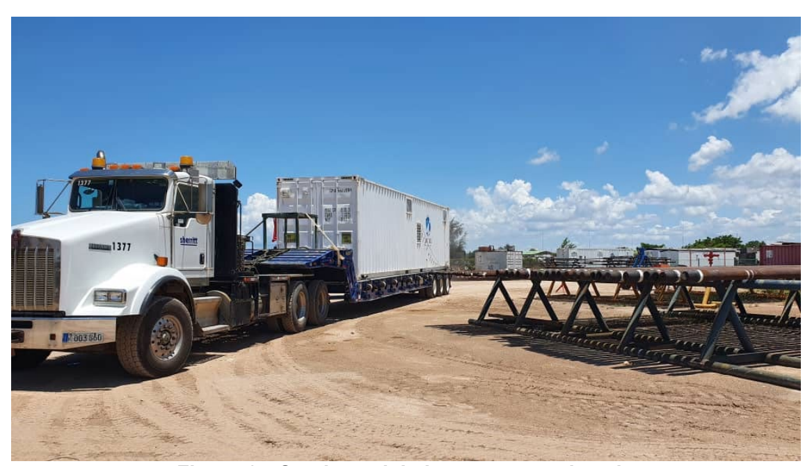
Figure 1 – Service unit being transported to site