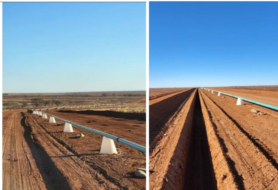
Figure 1-2 Yarrow 3 Pipeline under construction May 2023

“Red Sky is pleased with the progress of the construction of the pipeline which is on budget and on time.”