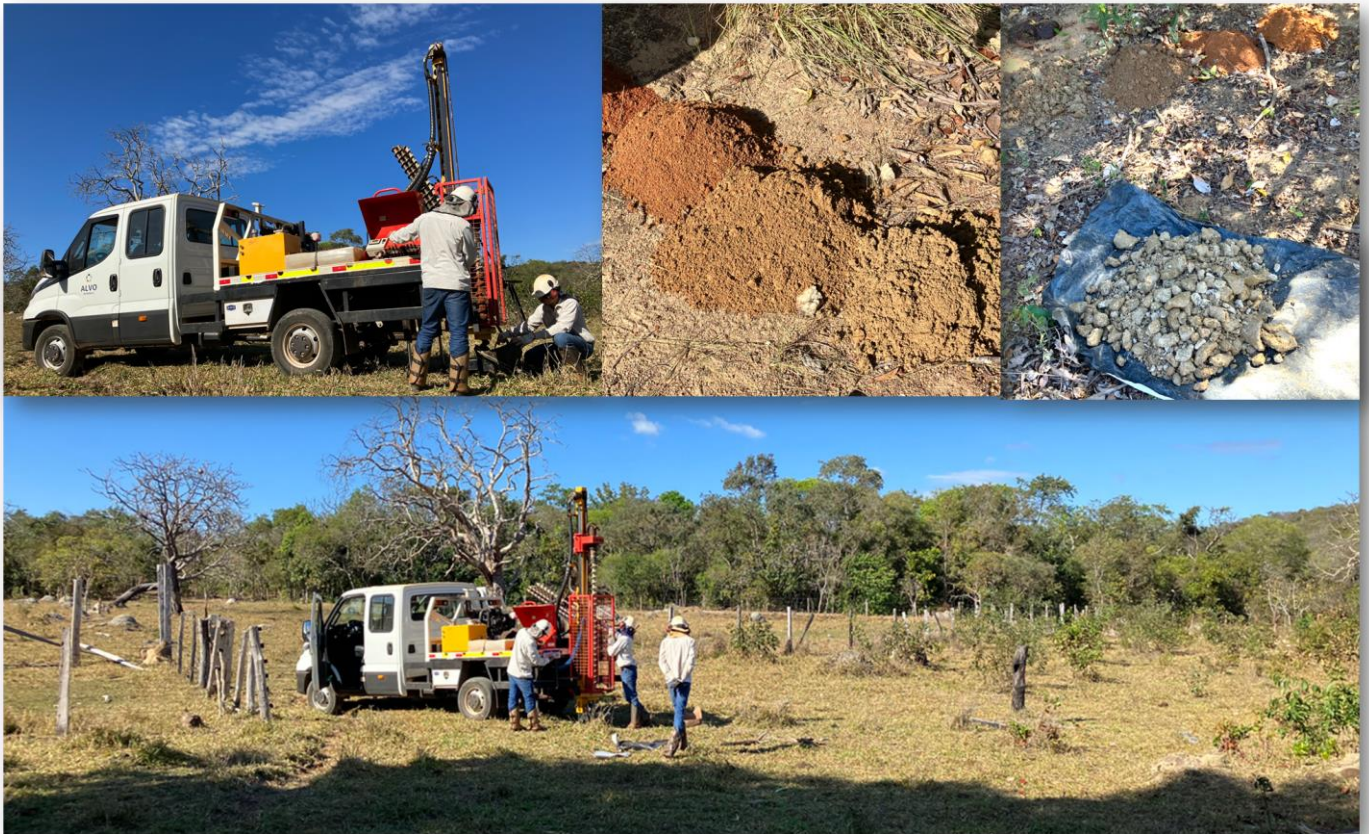
Figure 1 Alvo's auger rig drilling at Bluebush REE Project. Note the piles of samples representing saprolite intercepted in the hole (each pile represents a metre of advance).

The maiden drill program will initially commence at northern prospects Fazendinha and Ferradura (see Figure 2), that intercepted rare earth mineralisation from surface to end of hole (EOH), including 2 :