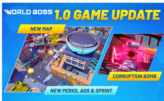
DEVELOPMENT ON WORLD BOSS IS COMPLETE FOLLOWING ITS GLOBAL LAUNCH IN JUNE