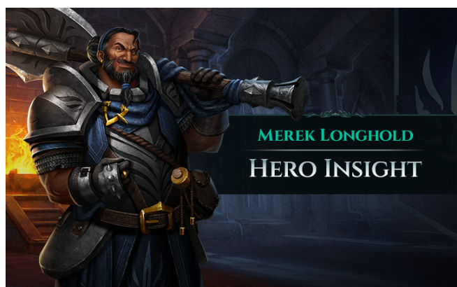
THE AGE OF DARKNESS CAMPAIGN WAS RELEASED IN APRIL WITH NEW MISSIONS AND A NEW CHARACTER