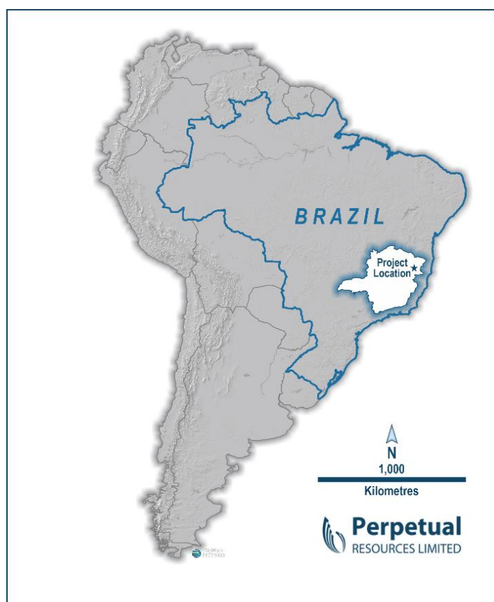
Figure 1 – Location of the prospects under Option in the prolific region of Minas Gerais, Brazil.

We also are forging a close working relationship with the permit vendor group and several other in-country specialists, which gives Perpetual significant capacity to quickly assess these compelling exploration ground positions and ultimately quickly add value through exploration activities”.