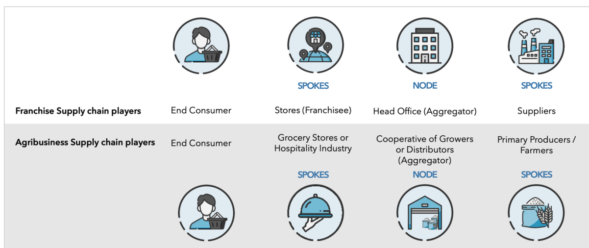
Figure 2: Agribusiness Node-to-Spoke strategy

The Agribusiness sector is an attractive segment for Spenda, as it's a natural fit for its Node-to-Spoke strategy within a supply chain (see Figure 2) and the substantially large transactions and payment flows involved, surpassing those seen in many other industries. By aligning Spenda and FSC more closely, the Company has the ability to gain access to a vast ecosystem of Agribusiness participants, enabling it to provide liquidity and financial services at various levels of the value chain.