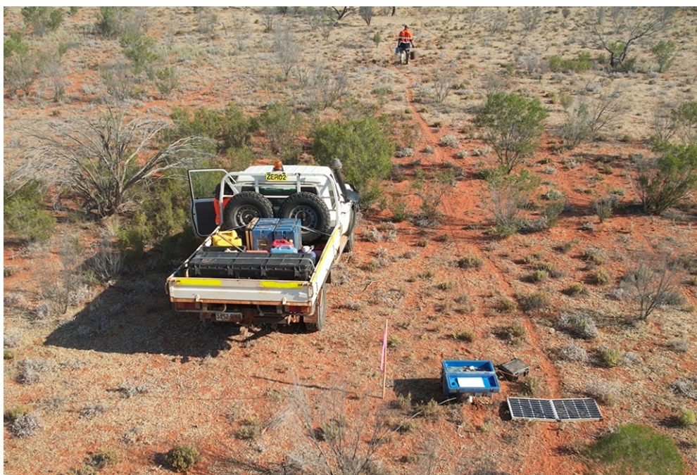
Figure 1: MT survey underway at the Mundi Project

‘The Mundi Project exemplifies SER’s strategy of science-driven exploration undercover in frontier locations across Australia. The project was initially identified through the review of precompetitive data and with the support of a $50,000 NSW Government New Frontiers Exploration Program grant, SER will complete a surface based geophysical program that is expected to define a target or multiple targets for follow-up drill testing’.