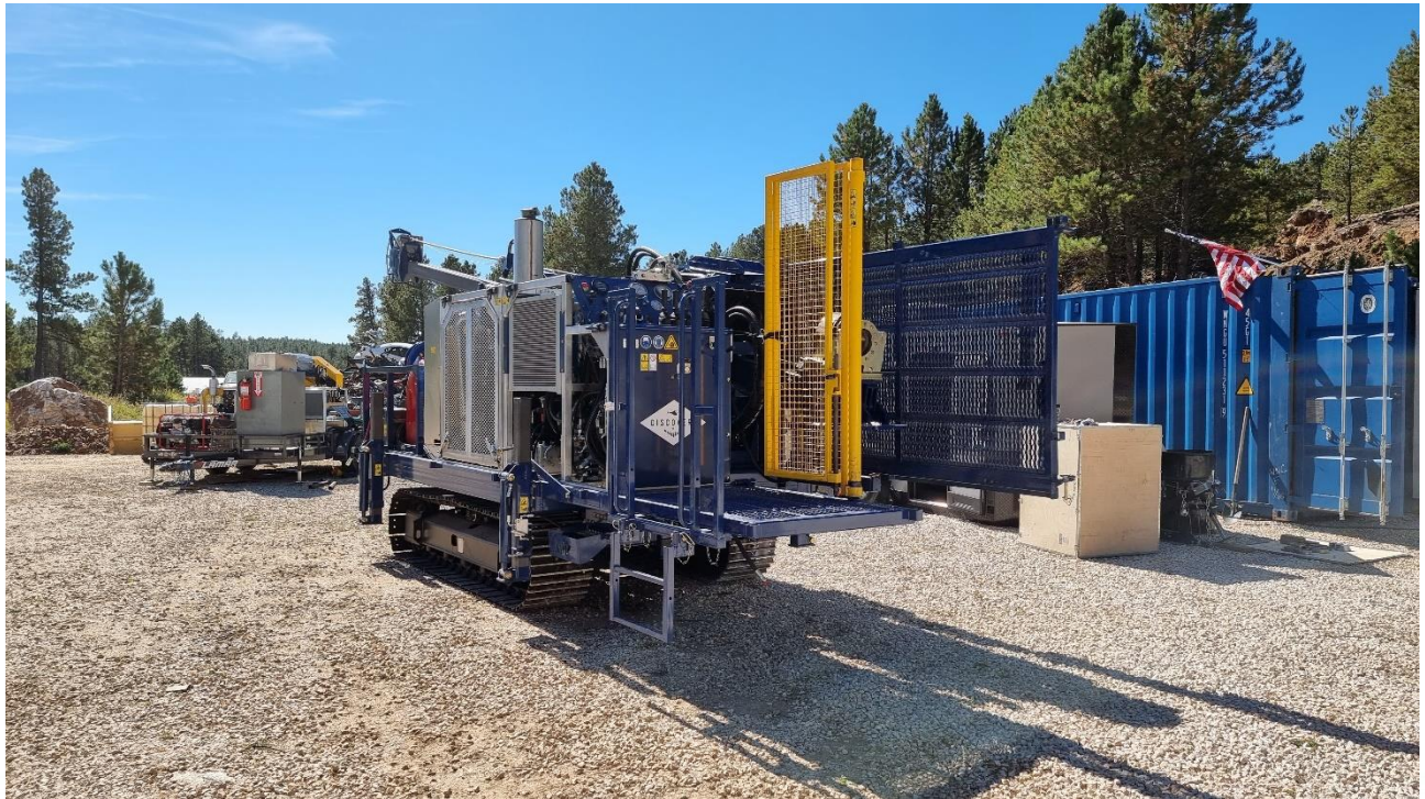
Figure 1: Photo of the new diamond rig arrived at the Beecher Project

The diamond drilling program is designed to test the strike and depth extensions of the Beecher pegmatites. The information IRIS obtains from selected holes will also be used for metallurgical and geotechnical test work for use in future scoping studies.