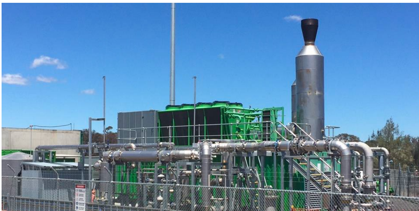
Landfill Gas to Power Generation Facility, Western Sydney – TSF Power

TSF Power is consistently pursuing new long term parts sale agreements and long-term operations support contracts with additional large institutional and waste management entities in Australia and New Zealand.