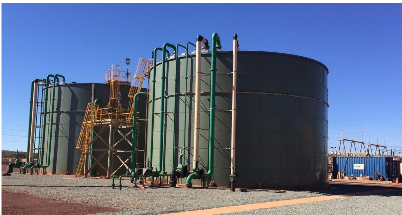
BHP Yarnima Power Station, Newman, WA – Tank Industries

The team at Tank Industries has benefited from the new working environment at EVZ with a transformed business strategy including the opportunity to work alongside the Syfon Systems team. This has allowed us to maximise our market penetration and improve the operational performance in the shortest possible time. We continue to research and develop the suite of tank products through value engineering to improve their market appeal for a wider and more discerning client base.