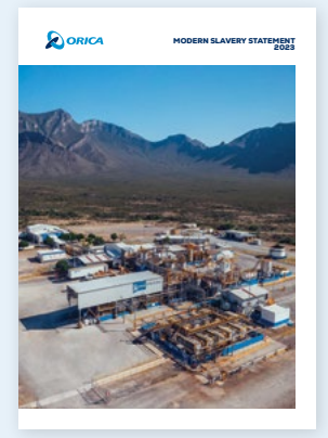
FY2023 Modern Slavery Statement

Climate-related information aligned to the recommendations of the Task Force on Climaterelated Financial Disclosures.