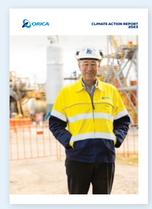
FY2023 Climate Action Report

Climate-related information aligned to the recommendations of the Task Force on Climaterelated Financial Disclosures.