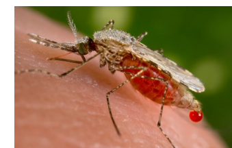
Anopheles stephensi mosquito - anopheline mosquitoes are the only vectors of malaria.