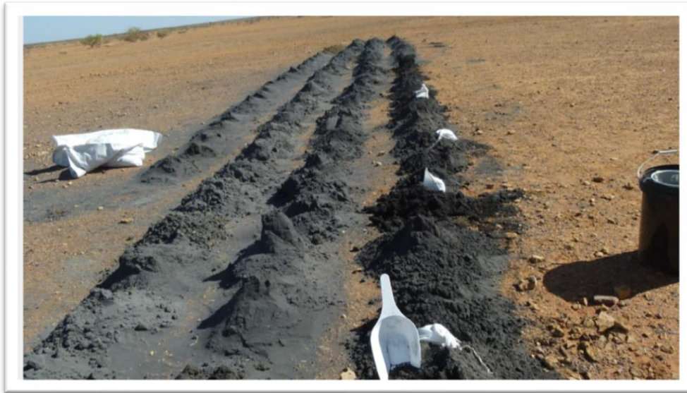
Figure 3. Sample spoils of black shale, from previous RC drilling at the Byro Project.