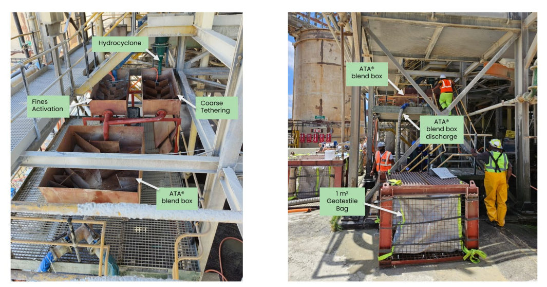
ATA<sup>®</sup> Demonstration Trials at South African Gold Mine