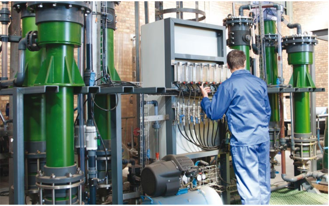
DESALX<sup>®</sup> Pilot Plant

Clean TeQ is using an automated plant which will treat 300 litres per day of wastewater over a 3-month period.