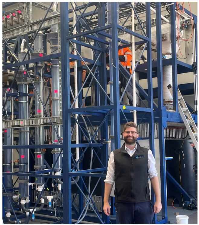
Clean TeQ's cDLE<sup>®</sup> demonstration plant for Lithium Bank