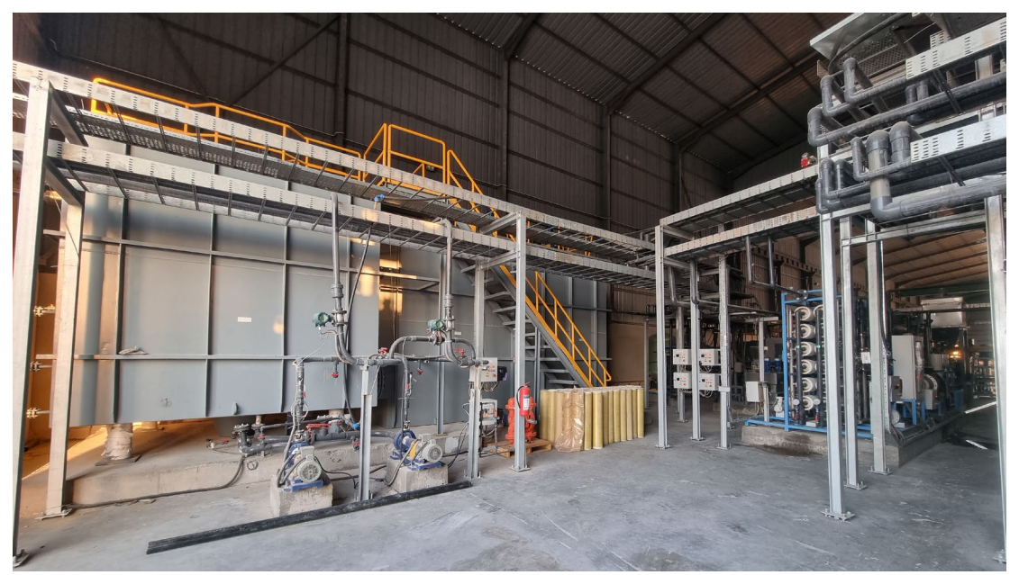
Photo of the brine recovery circuit of the HIROX<sup>®</sup> plant