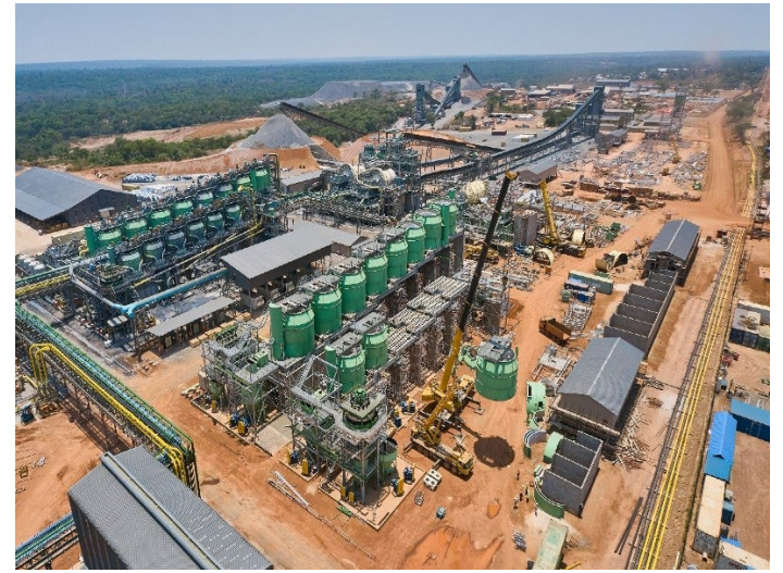
Kamoa Copper Plant, DRC

The test work for improved copper recovery in the flotation circuit at the Kamoa plant been finalised. Given the positive outcome in copper recovery, additional scope has been agreed and test work should continue in the next quarter.