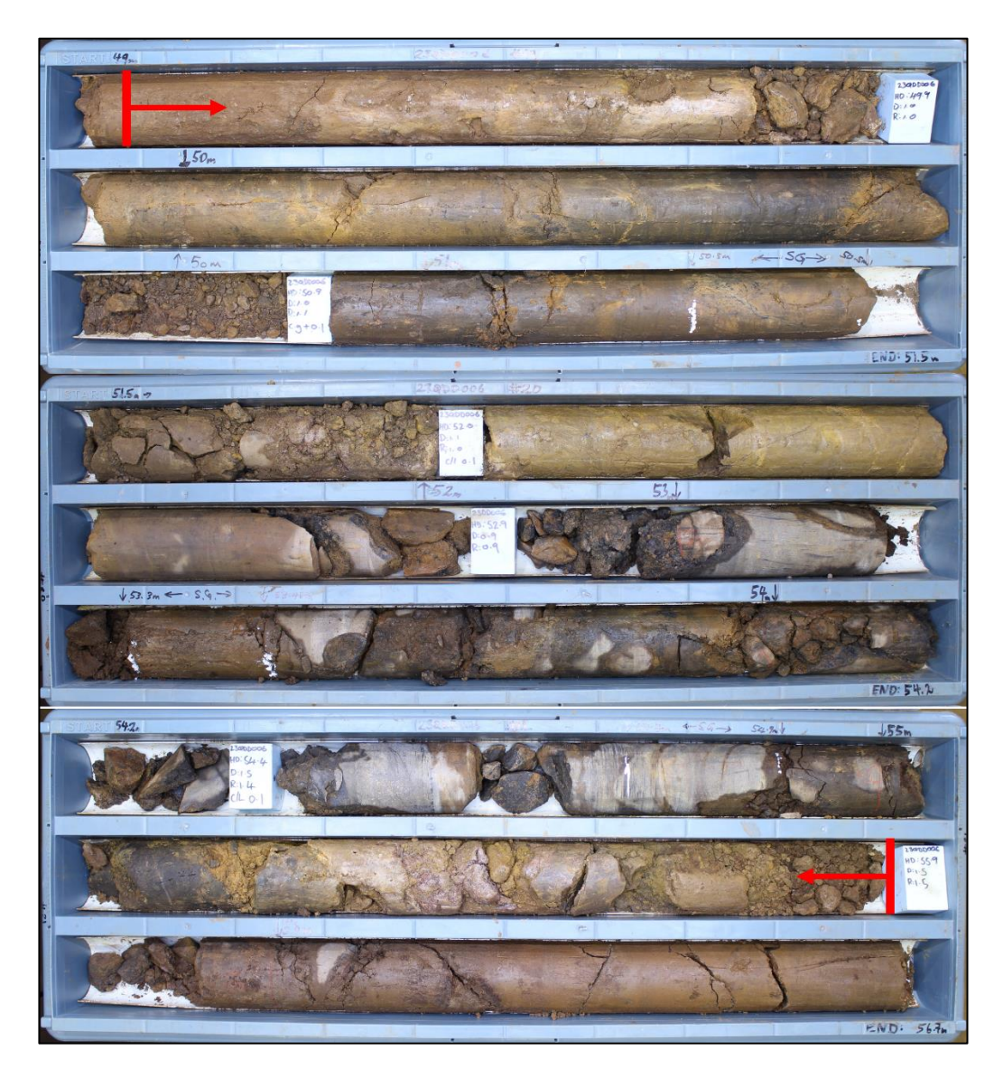
Figure 2: 23QDD006 6m @ 0.30% Co from 49m within darker manganese oxide rich layer