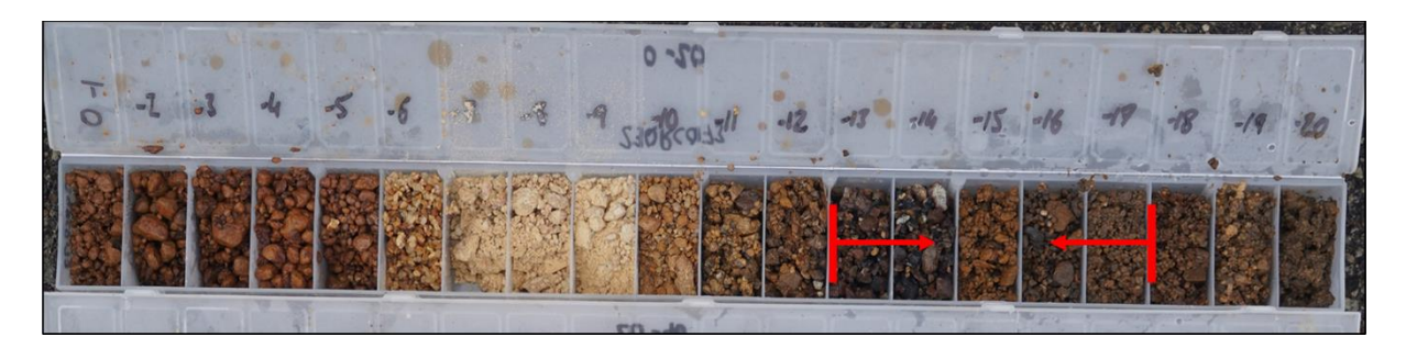
Figure 3: 23QRC0173 5m @ 0.23% Co from 12m