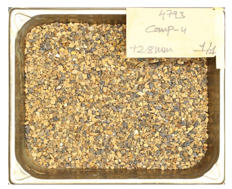
Figure 4: Scrubbed Composite 4 particles sized between 2.8mm and 6.0mm

During scrubbing and screening testwork in 2023 angular black particles were observed within the 1mm to 6mm size fraction of several composite samples tested. An example is shown in Figure 4. Cobalt and manganese grades were notably elevated in these fractions which, with learnings from gravity testing of finer material, motivated a preliminary gravity separation assessment.