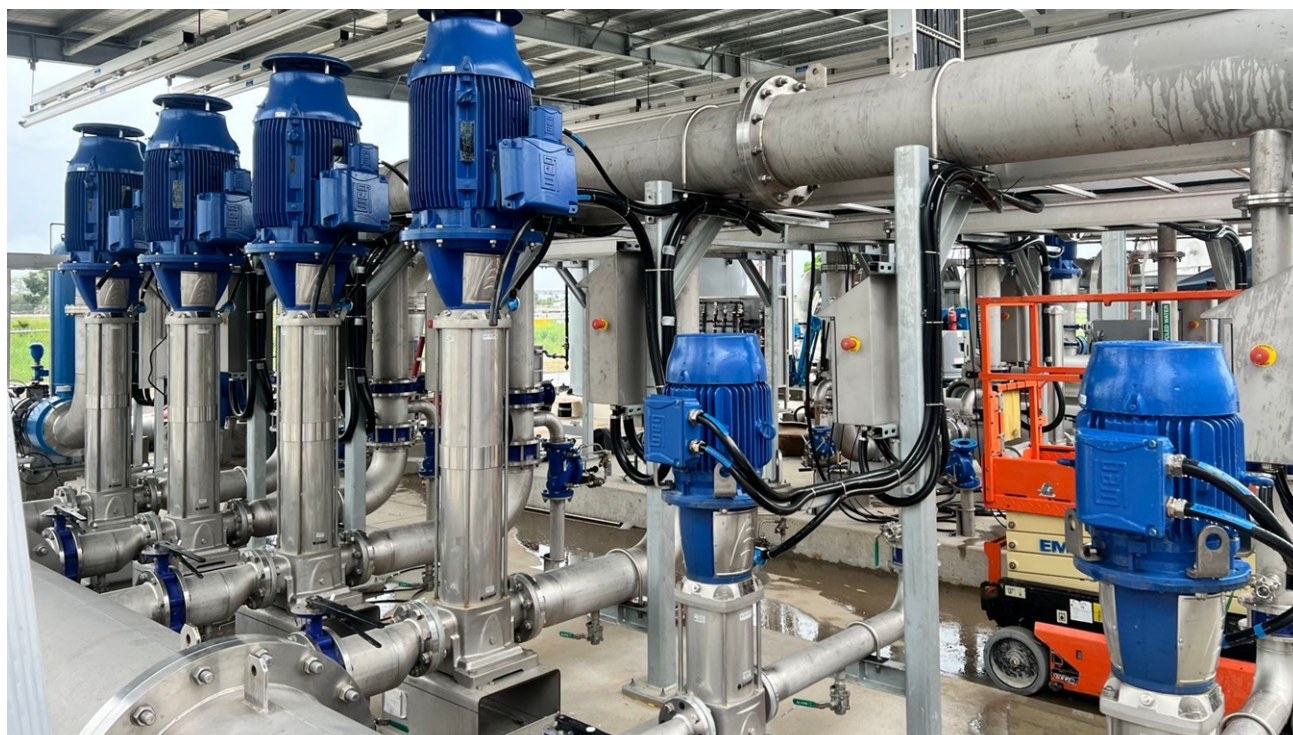
Electrical installation of equipment nearing completion

Significant progress has been made on the project in the current quarter, with the project successfully transitioning to the testing and commissioning stage. It is expected to be completed in Q3 FY24, remaining on schedule and within budget.