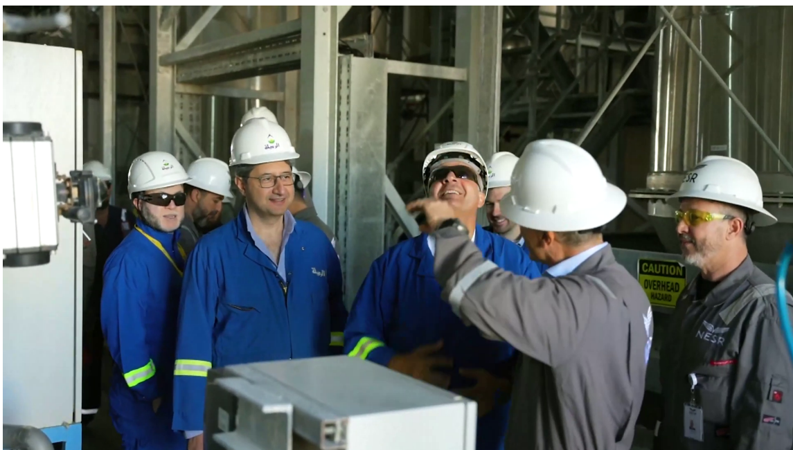
Photos from the inauguration of the HIROX® plant in the Middle East