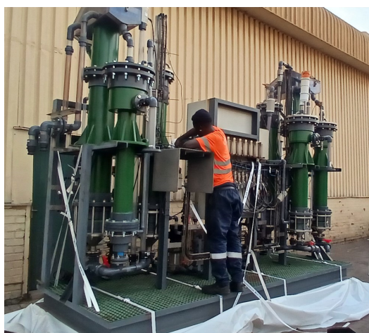
Pre-commissioned DESALX ® pilot plant shipping to Nyrstar

The automated pilot plant, capable of treating 300 litres of wastewater per day, will operate over a 3-month period. Pilot modifications were completed last quarter, and the plant has now been transported to the site.