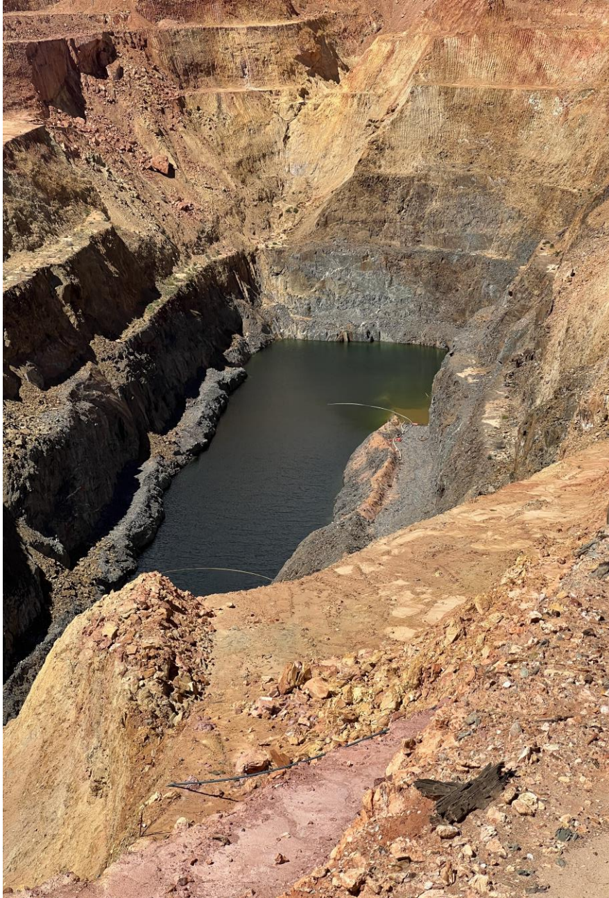
Anglo Saxon open pit April 2024 looking south