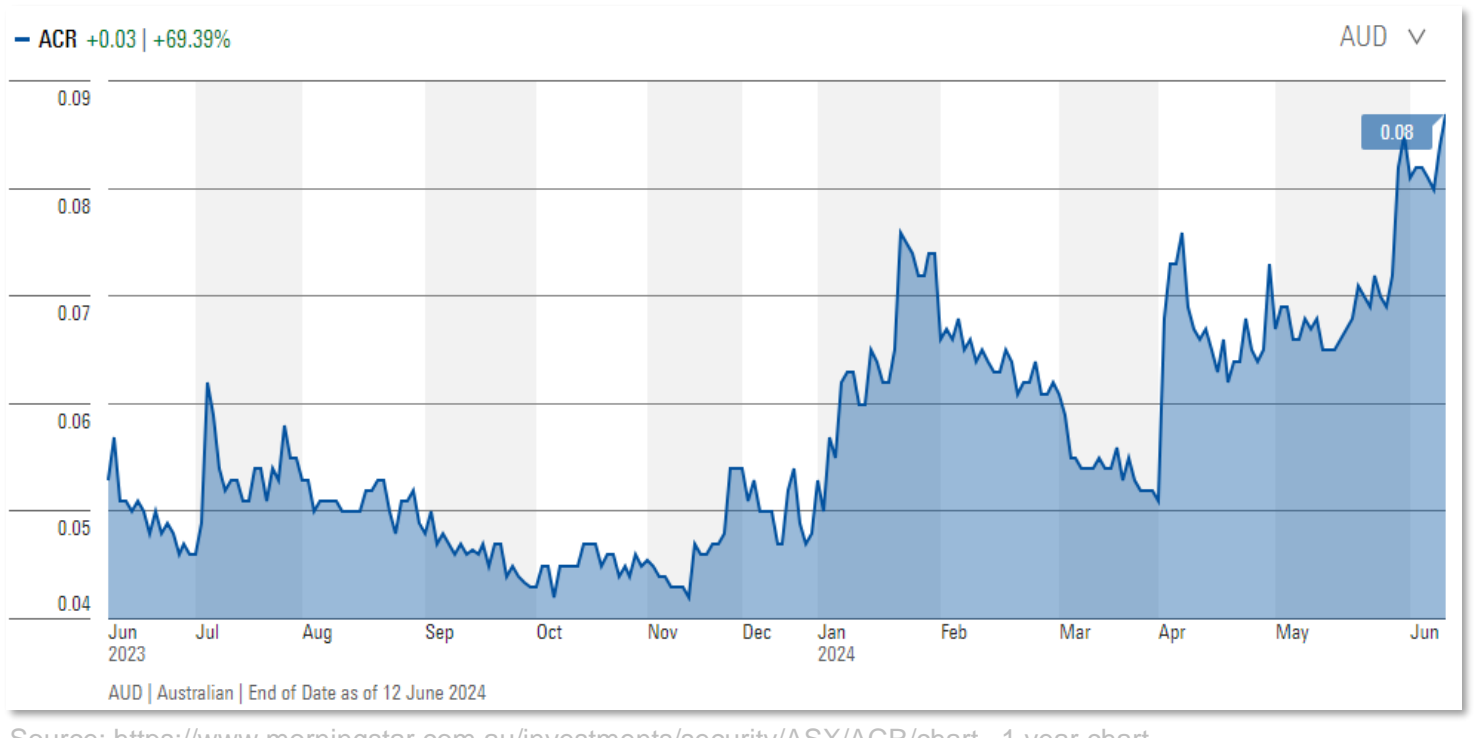
1 year chart