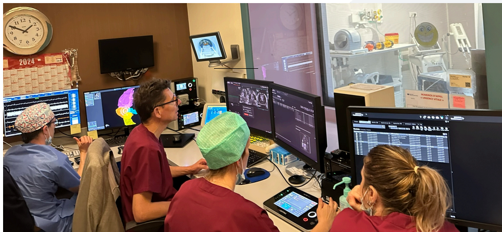
VISABL-AFL procedure at ICPS

The VISABL-AFL (“ V ision- M R A blation of A trial F lutter”) clinical trial, (ClinicalTrials.gov Identifier: NCT0504548) is a prospective, single-arm, multi-centre global investigational study of the safety and efficacy of type I atrial flutter ablation procedures performed with the Vision-MR Ablation Catheter (second generation) and Osypka HAT 500 RF generator and irrigation pump.